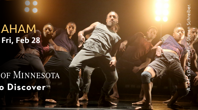
A.I.M.'s Drive.