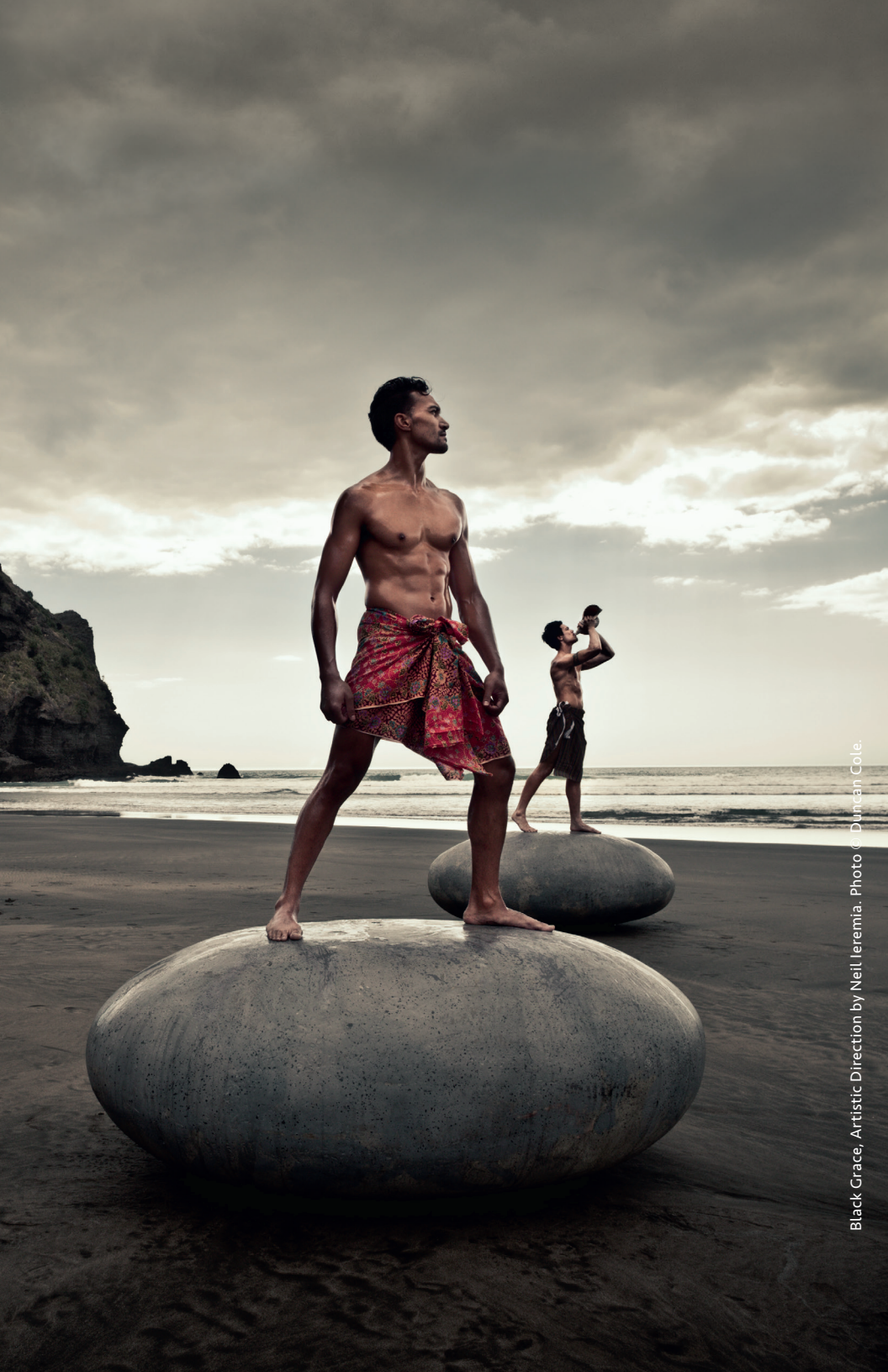
Black Grace, Artistic Direction by Neil Ieremia.