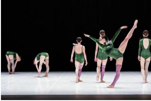
CCN-Ballet de Lorraine Performing Devoted