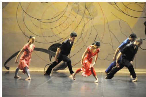
CCN-Ballet de Lorraine Performing Fabrications