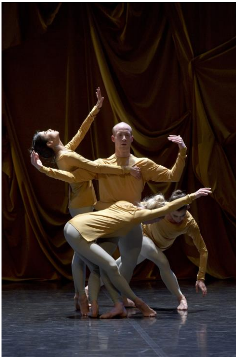
CCN-Ballet de Lorraine Performing Sounddance

The second piece is Fabrications . This 1987 dance is constructed of a gamut of 64 movement phrases, corresponding to the 64 hexagrams in the I Ching (the Chinese Book of Changes ). According to Cunningham, the title refers to both meanings of the verb "to fabricate": to combine parts to form a whole, and to invent or concoct, even to lie. The dance features the music by Emanuel Dimas de Melo Pimenta, performed live by the composer, and a striking visual design by artist Dove Bradshaw.