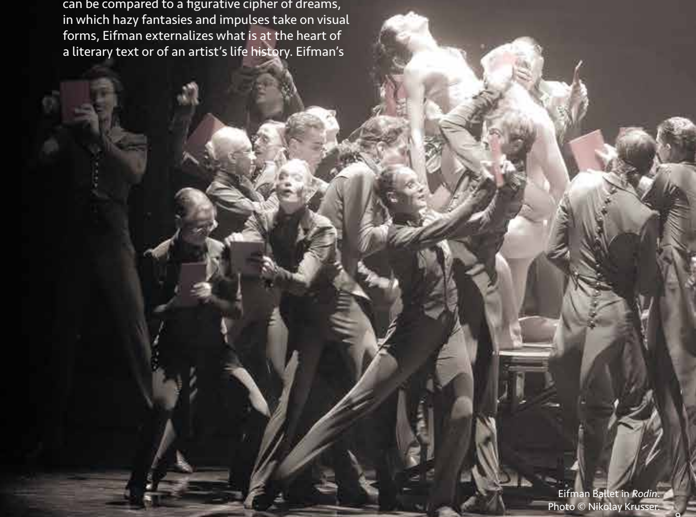
Eifman Ballet in Rodin.

When Eifman turns to the works of great writers or to the lives of geniuses and translates them into the language of ballet, this is immersion, through the physical, in the psychic, through the body, in the soul, through words, in ideas. His unique lexicon and conceptual, authorial interpretations are a breakthrough into that fantastic dimension where the boundlessness of inner worlds comes to life.