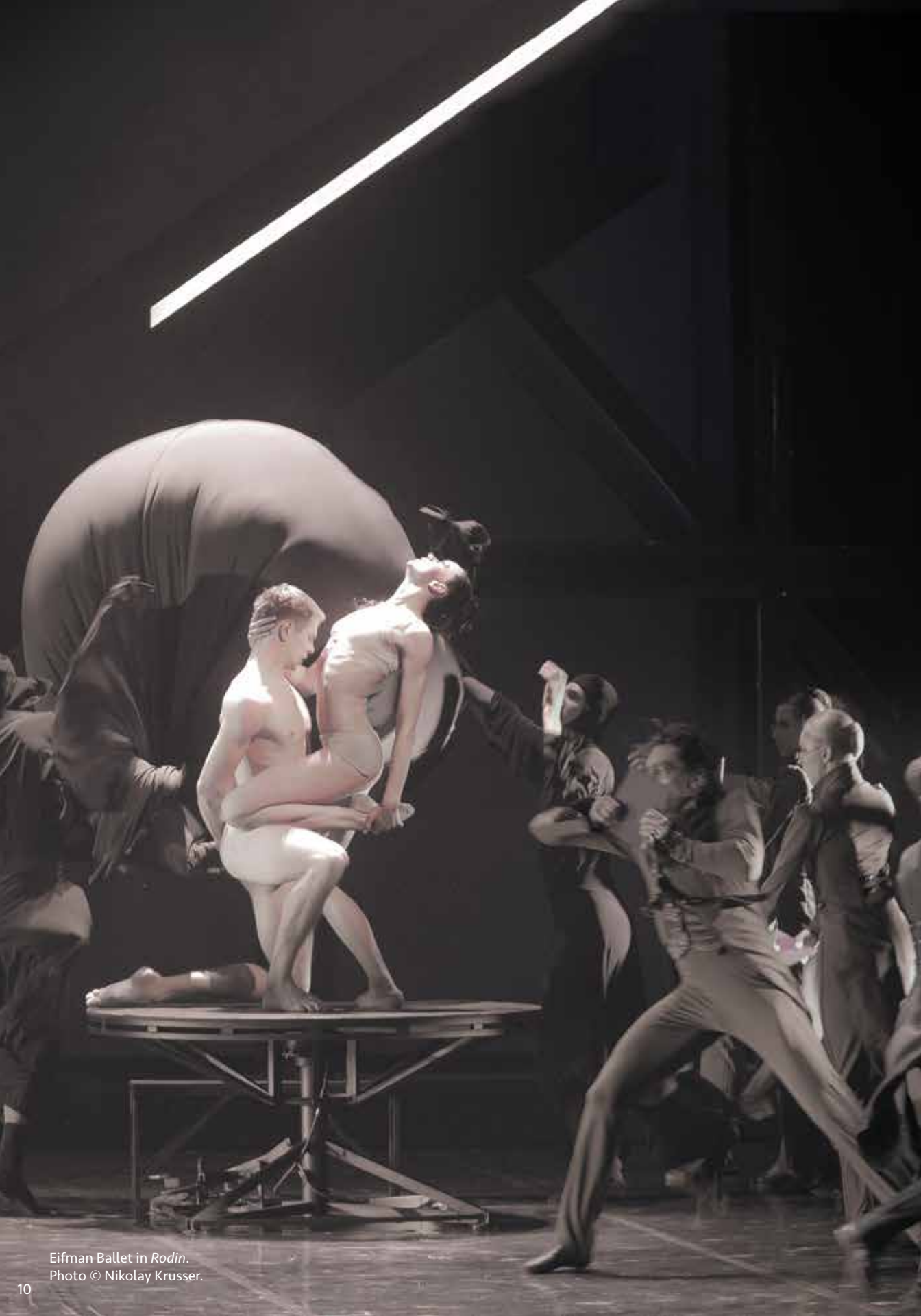
Eifman Ballet in Rodin .