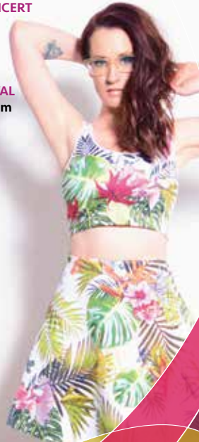
Ingrid Michaelson

UNIVERSITY OF MINNESOTA Driven to Discover™