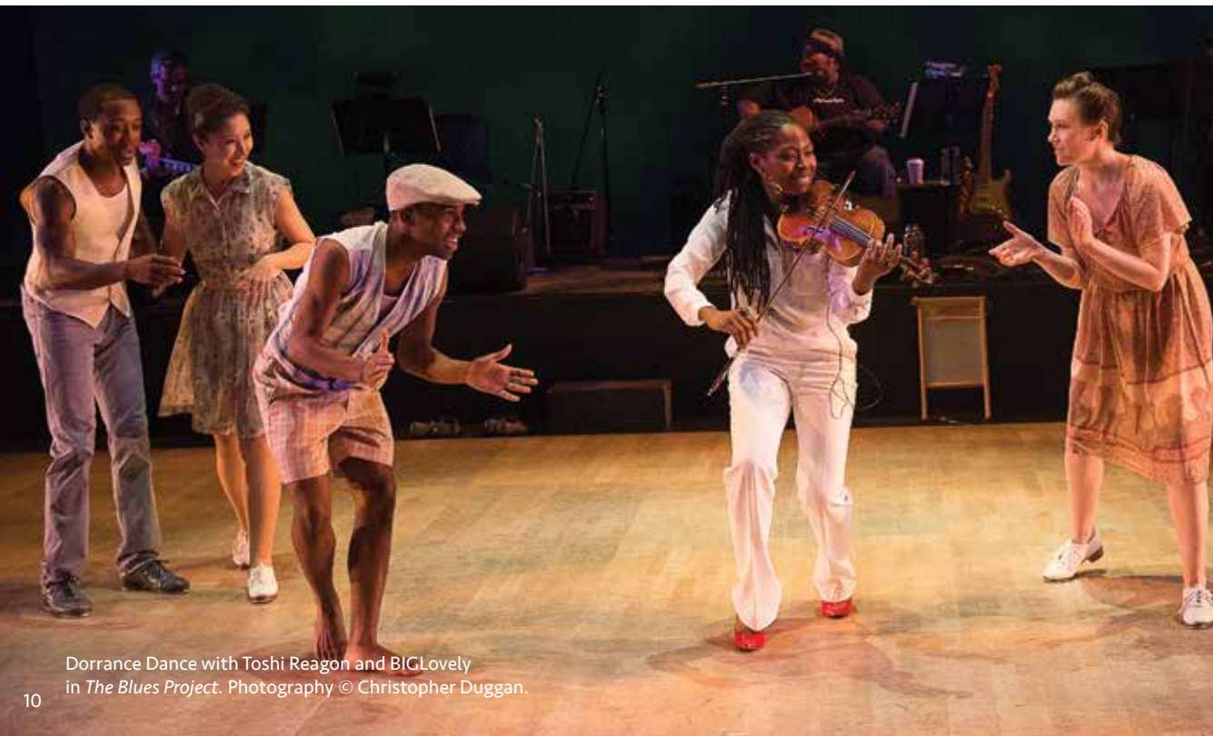
Dorrance Dance with Toshi Reagon and BIGLovely in The Blues Project.