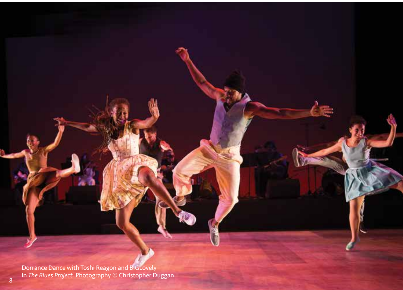
Dorrance Dance with Toshi Reagon and BIGLovely in The Blues Project.