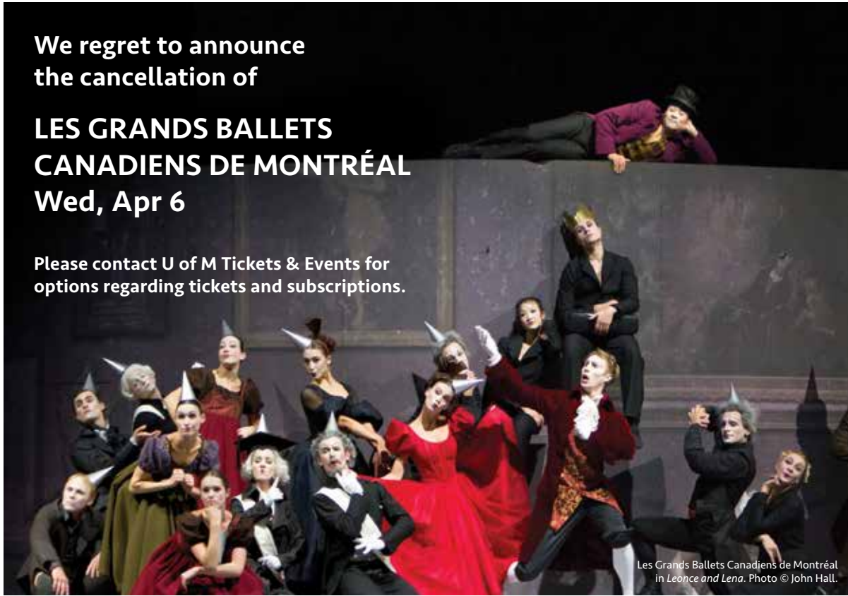
Les Grands Ballets Canadiens de Montréal in Leonce and Lena.

Please contact U of M Tickets & Events for options regarding tickets and subscriptions.