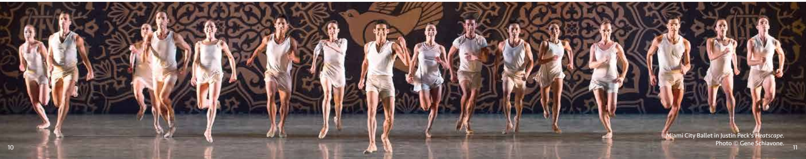
Miami City Ballet in Justin Peck's Heatscape .

Full artist biographies are available at miamicityballet.org