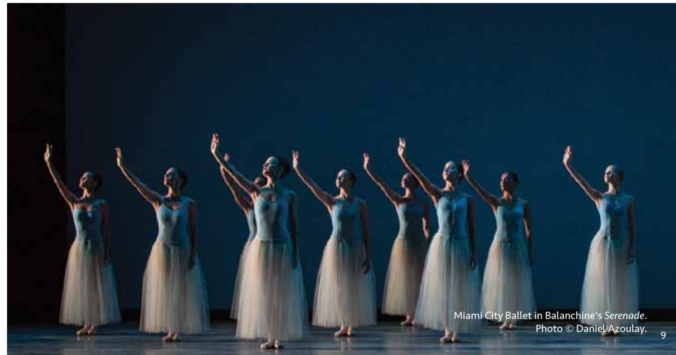
Miami City Ballet in Balanchine's Serenade .

MCB's Share the Dance: Community Outreach and Educational Programs reach deep into the community, touching nearly 17,000 young people, seniors and other traditionally underserved community members annually through a wide array of programming—a dramatic 42% increase from the previous year's activities. This expanded portfolio of programs introduces new and underserved audiences to the art form of classical ballet while building strong community relationships and engagement with the arts.