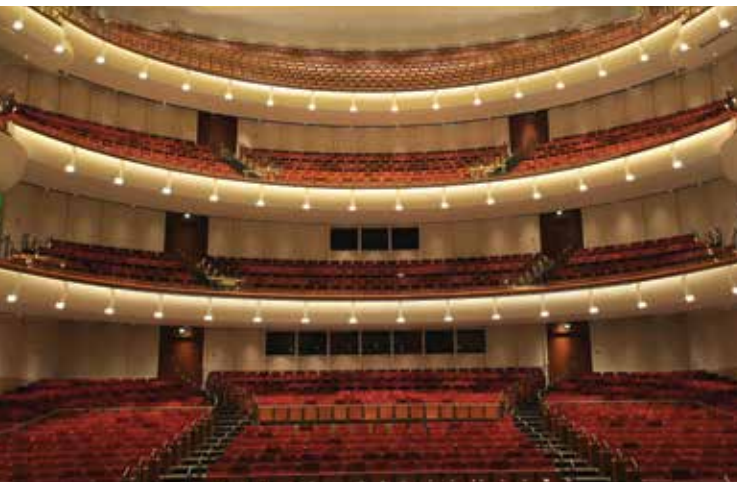
Seating in the theater now wraps the stage in three balconies.

The new performance space is a 2,700-seat hall with superior acoustics and sightlines, and state-of-the-art technologies to provide the highest quality experience attainable. The new hall features the finest in artistic performance—exhilarating, cultural experiences, designed in collaboration with academic units and community partners, to inspire students and the people of Minnesota.