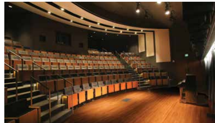
The Best Buy Theater is designed for lectures, films, and recitals.

Perched between picturesque views of the Mall and Northrop’s dynamic public spaces, these commons offer technology-rich informal gathering and collaborative spaces for students, faculty, and members of the community.