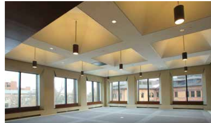
The Lindahl Founders Room is a carefully crafted and well-equipped event space.

Reviving a space closed to the public since the opening of the Weisman Art Museum, this sky-lit gallery was the original home of the University Art Museum.