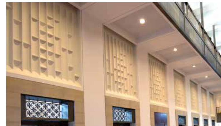
The Laban panels in the Atrium are both historic and contemporary.

Once experienced as an extension of the proscenium arch in the historic auditorium, these columns, vaults, and urns now play in the surrounding lobby, both marking the vestiges of the original auditorium footprint and providing a sculptural stage to be experienced every day.